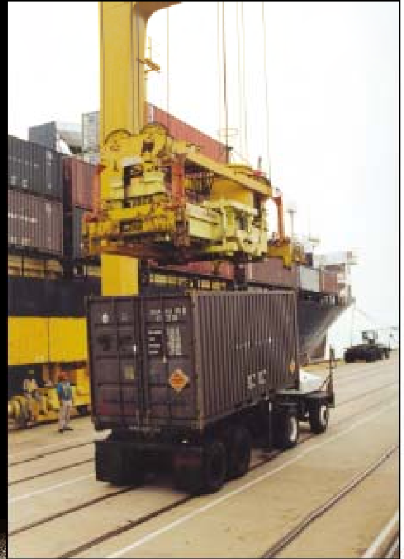
The container is symbolizing MTMC's increasing role in the supply of Department of Defense forces in Afghanistan.